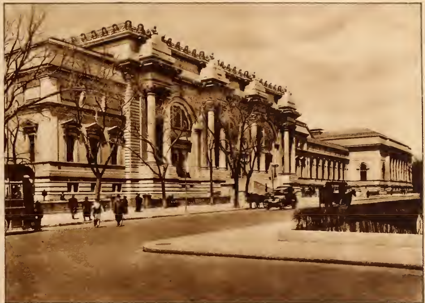
METROPOLITAN MUSEUM OF ART, 82nd Street and 5th Avenue.